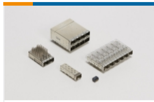
SFP, SFP+ & zSFP+(1)